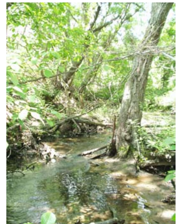
URI Watershed Hydrology Lab

Areas with low impervious cover (< 10%) have streams that can support a wide array of plants, macroinvertebrates, and fish.