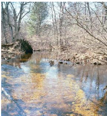
URI Watershed Hydrology Lab

The average IC in the Narragansett Bay watershed is 14%.