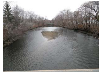
Woonasquatucket River at Dean St.

In the Narragansett Bay Region, impaired streams are found in areas with high impervious cover.