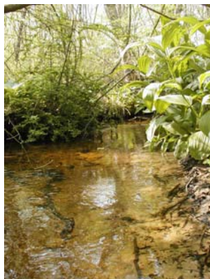
URI Watershed Hydrology Lab