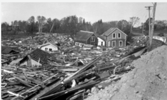
RI State Archives

Coastal properties are valued for their scenic views and ocean access, but increasingly these seaside havens are at risk from intensifying hazards associated with climate change. By 2100, an estimated 7000 people living in over 3000 housing units within the state's coastal communities may experience flooding based on a 7-foot sea level rise projection.