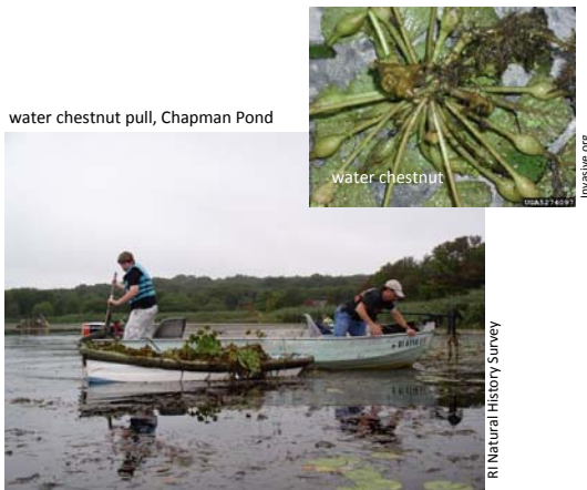
water chestnut pull, Chapman Pond

In Rhode Island, freshwater invasives have been found in over 70 lakes and ponds.