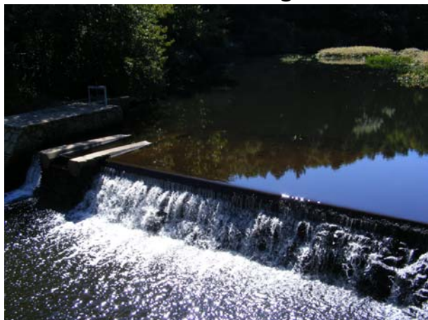
RI Department of Environmental Management