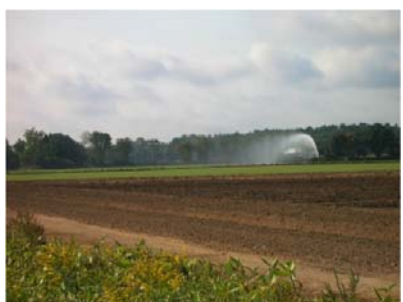
RI Dept. of Environmental Management

Demand for freshwater is highest in summer, when stream flow is naturally lowest