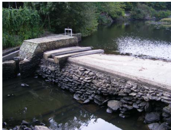
RI Department of Environmental Management